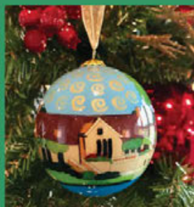
Weston Lakes Custom GLASS Ornament $26