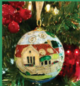
Weston Lakes Custom CLOISSONNE Ornament $45