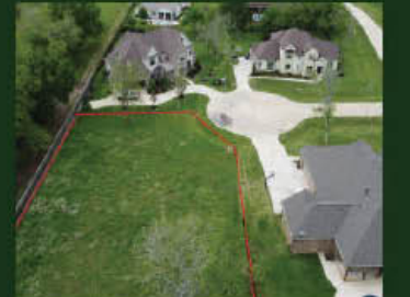
32823 Whistler Ct. Rare Weston Lakes Lot Half-Acre with plans $225,000