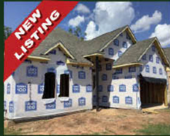
33006 Woodlake Dr. 3 Bed / 2.5 Bath / 2,641 s.f. NEW CONSTRUCTION $488,585