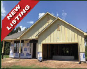
33010 Woodlake Dr. 3 Bed / 2.5 Bath / 2,461 s.f. NEW CONSTRUCTION $455,285