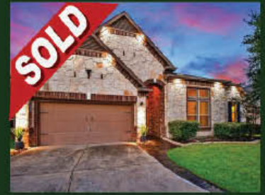
1107 Crosby Sky Ct., Katy 4 Bed / 2.5 Bath 3,005 s.f.