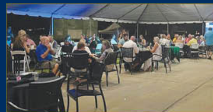
Dinner & entertainment