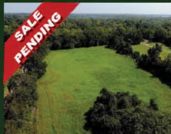
CR 151 in Boling 13 + Acres on San Bernard River $140,000