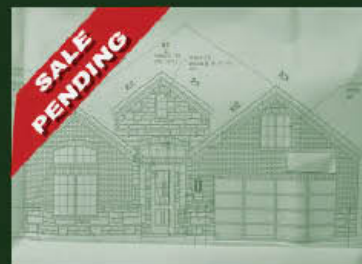
32918 Woodlake Dr. 4 Bed / 3 Bath / 2,642 s.f. New Construction $488,770