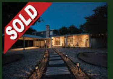
270 Susie Dr. Canyon Lake 4 Bed / 3 Bath