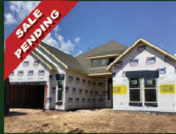
32910 Woodlake Dr. 3 Bed / 2.5 Bath / 2,450 s.f. NEW CONSTRUCTION $453,250