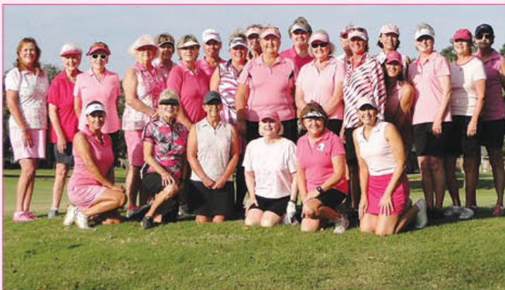
2021 Pink Lady Scramble - Pretty Ladies in Pink