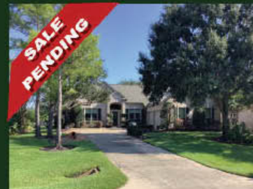
Weston Dr. 3 Bed / 2.5 Bath Golf Course Lot w/ Pool