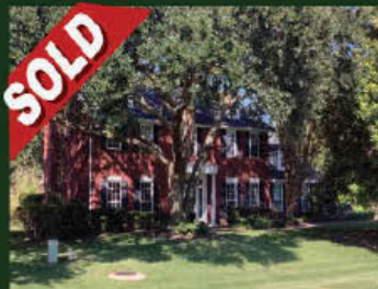
Westerdale 3 Bed / 3.5 Bath 0.65 Acre Waterfront Lot