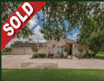
32707 Winwick 3,410 s.f. on 1+ acre 4 Bed / 3 Bath Generator/ Car Lifts in Garage