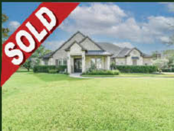
4018 Wentworth 4 Bed / 3.5 Bath 1.19 Acre Lot with Pool