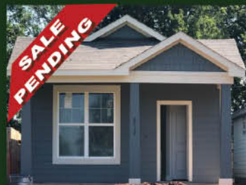
SALE PENDING 6418 Gresham in Wallis 3 Bed / 2 Bath $184,900