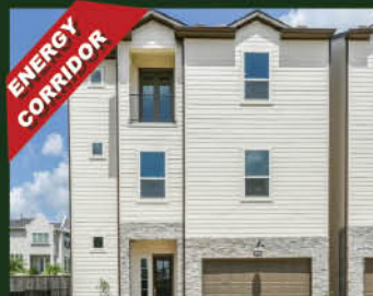
ENERGY CORRIDOR 10930 Brookeshire Chase Ln 3 Bed / 3 1/2 Bath Gated, Energy Corridor $439,900