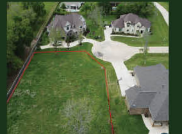
32823 Whistler Ct. Rare Weston Lakes Lot Half-Acre with plans $225,000