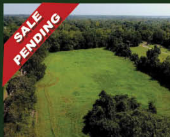
SALE PENDING CR 151 in Boling 13 + Acres on San Bernard River $140,000