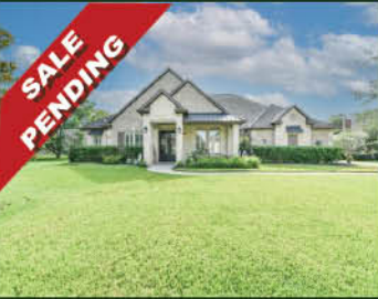
SALE PENDING 4018 Wentworth 4 Bed / 3 1/2 Bath 1.19 Acre Lot with Pool $869,900