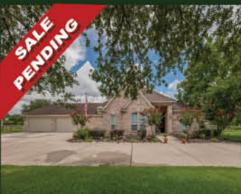
SALE PENDING 32707 Winwick 3,410 s.f. on 1+ acre 4 Bed / 3 Bath Generator/ Car Lifts in Garage $725,000