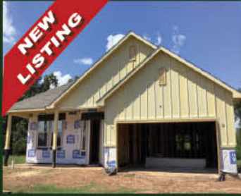
NEW LISTING 33010 Woodlake Dr. 3 Bed / 2.5 Bath / 2,461 s.f. NEW CONSTRUCTION $455,285