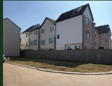
10931 Brookeshire Chase Ln 3000 s.f. Lot Gated, Energy Corridor $130,000