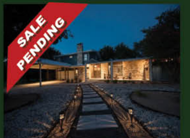
SALE PENDING 270 Susie Dr. Canyon Lake 4 Bed / 3 Bath $515,000