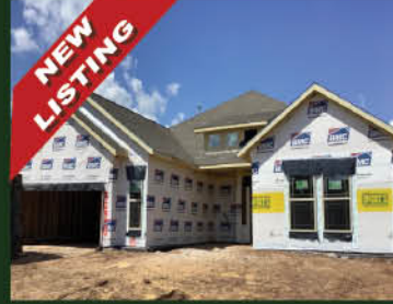
NEW LISTING 32910 Woodlake Dr. 3 Bed / 2.5 Bath / 2,450 s.f. NEW CONSTRUCTION $453,250