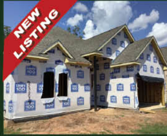
NEW LISTING 33006 Woodlake Dr. 3 Bed / 2.5 Bath / 2,641 s.f. NEW CONSTRUCTION $488,585