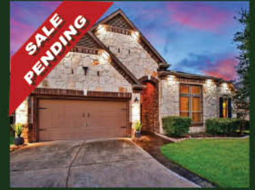
SALE PENDING 1107 Crosby Sky Ct., Katy 4 Bed / 2.5 Bath 3,005 s.f. $420,000