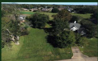
4606 Weston Dr. 0.4328 Acre Golf Course Lot on #15 Green $110,000