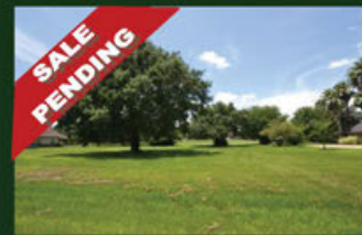
4015 Wentworth .75 Acres at #9 GREEN $169,500