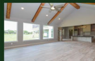
5011 Waterbeck 4,115 s.f. / 4 Bed / 4.5 Bath On Hole #6 Fairway $639,900