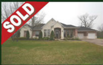
4202 Oxbow Circle East 4 Bed / 3.5 Bath POOL / 0.65 Acre Lot