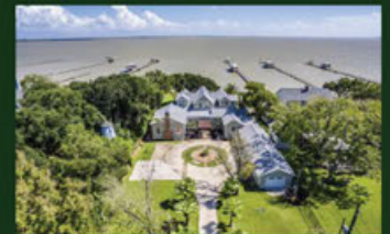
711 Bayridge Road Historic Home in Morgan's Point Completely Restored on Galveston Bay $990,000