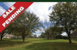
4716 Westerdale Over 3/4 Acre On #7 Green / #8 Tee $145,000