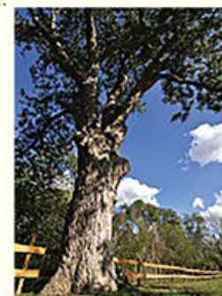
La Bahia Pecan Tree

The La Bahia Pecan was just a small tree when we declared independence from Santa Anna in 1836. The tree is located at a historic ferry landing where the Brazos and Navasota Rivers intersect. It is believed that a nut fell from a traveler's saddle bag because its DNA profile is from a pecan grove in Tamaulipas, Mexico. The La Bahia Pecan is over 200 years old. Another famous pecan tree is located west of Fort Worth in Weatherford (Parker County). Weatherford is home to the onetime National Champion Pecan Tree.