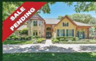
32914 Whitburn Trail Weston Lakes Custom Home on Golf Course $670,000