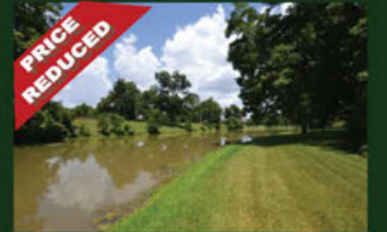
1/2 ACRE WATERFRONT LOT 32618 Watersmeet $165,000