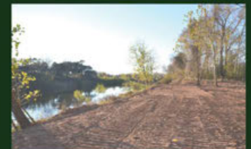
NEW LOTS With Brazos River Views CALL FOR DETAILS NO TIME LIMIT TO BUILD