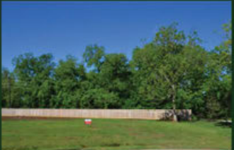
32823 Whistler Ct. Half Acre+ Lot In Prestigious Reserve Section 2 $132,000