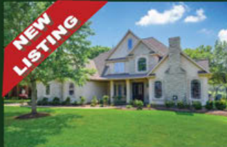
5519 Weston 4 Bed / 3.5 Bath View from #1 to #18 $475,000