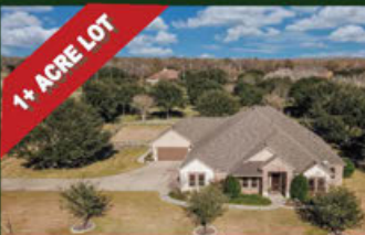
32522 Westminster 4 Bed, 5 Bath, 4 Car Garage Full In-Law Suite No Backyard Neighbor $749,900