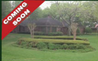
Waltham Crossing Weston Lakes One-Story on a Corner Lot