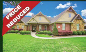
4319 Weston 4 Bed / 3.5 Bath POOL $479,000