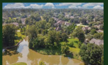
4710 Whickham Ct. 0.4663 Acre Waterfront Lot on Cul-de-sac $195,000