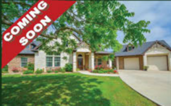
5327 Weston Great Home on #1 Green