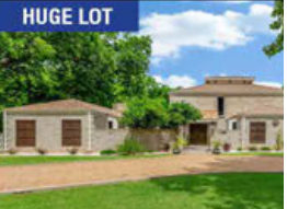
HUGE LOT Richmond 5202 Mimosa St 4/3.5/3 Remarkable home on 1.1 Acres. Uniquely designed with an open concept. $599,000

Each office is independently owned and operated