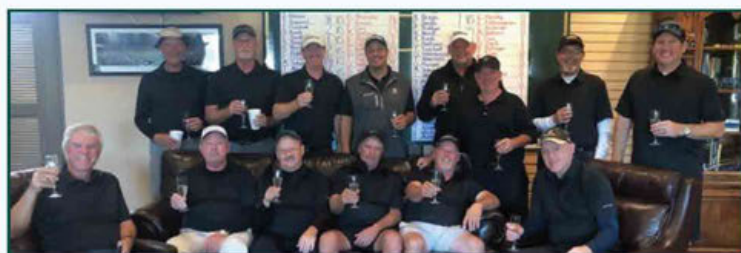
MGA team photo (not all present)