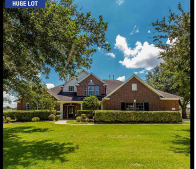
HUGE LOT Weston Lakes 4002 Wentworth 4/3.5/2 Extraordinary home on 1.2-Acre lot designed for entertaining. Huge Gameroom downstairs. $498,000