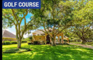
GOLF COURSE Weston Lakes 32511 Watersmeet 4/2.5/2 Stately two story on a wood- ed lot. Oversized bedrooms. $425,000