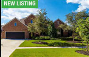
NEW LISTING Fulbrook on Fulshear Creek 30807 Crest View Terrace 5/4/3 Single Story set on a HUGE lot with high ceilings, plantation shutters and gorgeous wood floors. $485,000