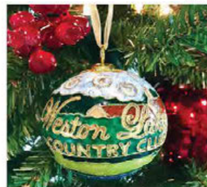
Weston Lakes Custom CLOISONNE Ornament