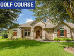
GOLF COURSE Weston Lakes 32603 Weston Ct 3/3.5/3 Sprawling 1-Story on a quiet Cul-de-Sac lot with Golf Course Views. $399,000