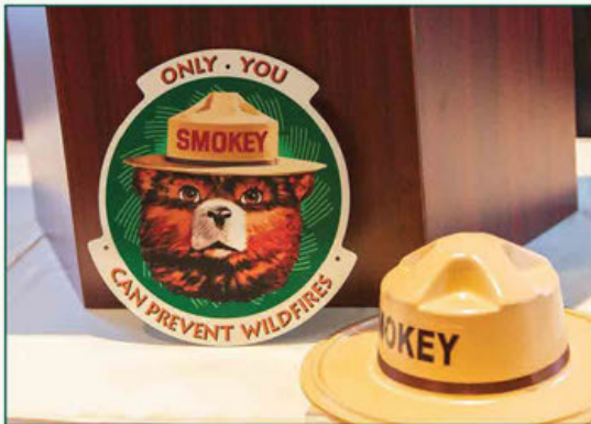
Fun Fact, Smokey the Bear is 75 years old.