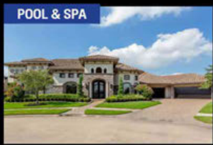
POOL & SPA Lakes Of Bella Terra 11519 Lago Verde Dr 5/5 & 2 1/2/4 1/2-Acre Cul-de-Sac setting. Resort POOL & SPA, covered Porches and PAVILION. $1,295,000