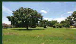
4015 Wentworth .75 Acres at #9 GREEN $169,500