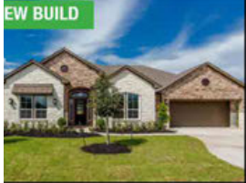
NEW BUILD Weston Lakes 32806 Winslow 4/3.5/3 1.5 Story New Construction. Fully Upgraded $499,000