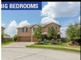
BIG BEDROOMS Tamarron 8911 Glacier Bay Ct 8/3.5/3 1.5 Story Home set on an oversized lot with no rear neighbors. Plenty of space. $49,000