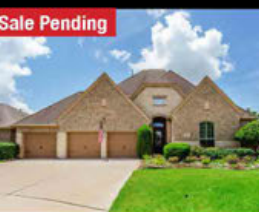
Sale Pending Weston Lakes 32730 Wingfoot Cr. 3/2 & 2 1/2 1.5 Story Home set on a Golf Course Setting. Stunning details throughout! $425,000