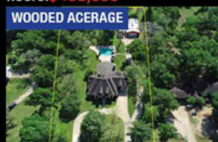
WOODED ACERAGE Richmond 202 Carroll Road 4/3 & 2 1/2/2 POOL, SPA, GAZEBO & WORK- SHOP. Summer Kitchen. LOW TAXES! $550,000