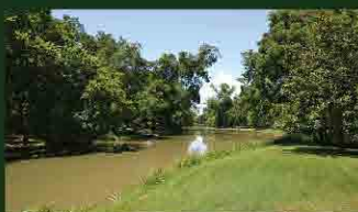
5319 Westerdale .60 Acres on PECAN LAKE $184,500