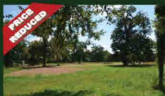
WESTHAVEN CT 1+ Acre Lot with Mature Trees Near Reserve Sec. 5 $140,000