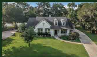
5018 Oxbow Circle East WATERFRONT HOME 3,554 s.f. / 3 Bed / 3.5 Bath $497,000