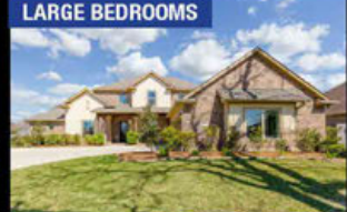
LARGE BEDROOMS Weston Lakes 4423 Warington St. 4/3.5/2 2 Story. Designer tiles, fine granites, and custom built-in cabinetry $435,000