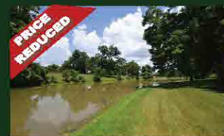
1/2 ACRE WATERFRONT LOT 32618 Watersmeet $165,000