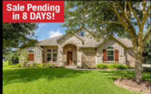
Sale Pending in 8 DAYS! Weston Lakes 4703 Whickham Ct 3/2.5/3 SINGLE STORY on Cul-de-Sac, expertly designed and masterfully crafted. $425,000