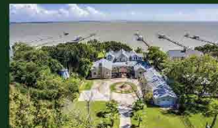
711 Bayridge Road Historic Home in Morgan's Point Completely Restored on Galveston Bay $1,100,000