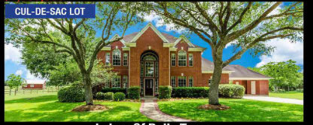
CUL-DE-SAC LOT Lakes Of Bella Terra 11806 Frutetto Ct 4/3.5/3 Sprawling SINGLE STORY exquisitely finished to meet the demands of the discerning Buyer $469,000