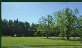
32723 Waterfowl Dr. 19,194 s.f. lot Backs up to Riverwood $93,500