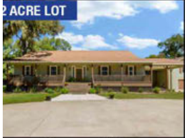
2 ACRE LOT Pecan Hill 723 Gainsborough Dr 4/3/2 Meet your country dreams with a Pool & Apart- ment above the garage. $50,000