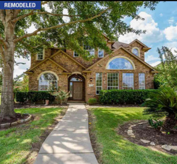
REMODELED Weston Lakes 33203 Woodton Court 5/3.5/2 Completely remodeled 2-story with an outstanding floor plan with a detached garage. $339,000