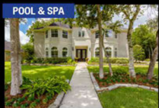
POOL & SPA Weston Lakes 3511 Wellspring Lake 5/3.5/5 2-story Mediterranean Beauty on 1.1 Acre Lot. Salt water POOL. $895,000