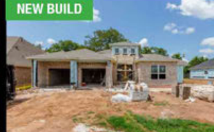
NEW BUILD Weston Lakes 3527 Wellborn Dr 3/2.5/2 New Build 1-Story with Tuscan exterior and plenty of space to entertain. $429,000