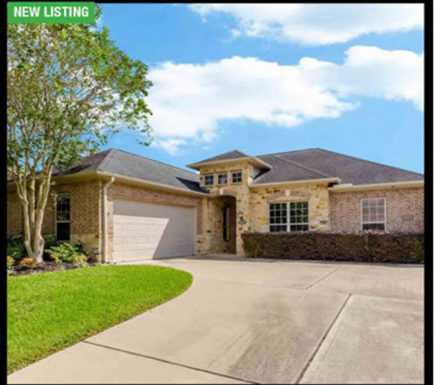
NEW LISTING Weston Lakes 5022 Westchester Dr. 3/2/2 Exquisite Single Story with open floor plan, spacious rooms and plantation shutters throughout. $320,000