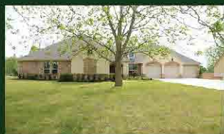
3108 Bowser Rd. 4 Bed, 3 1/2 Bath Private Entrance / .7 acre lot $540,000