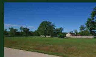
SELECTED LOTS IN THE RESERVE AT WESTON LAKES CALL FOR DETAILS