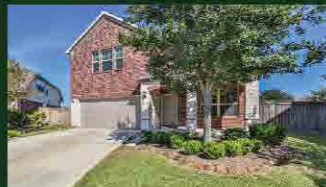
4803 Guster 4 Bed / 2.5 Bath / 2,423 s.f. Cinco Ranch $283,500