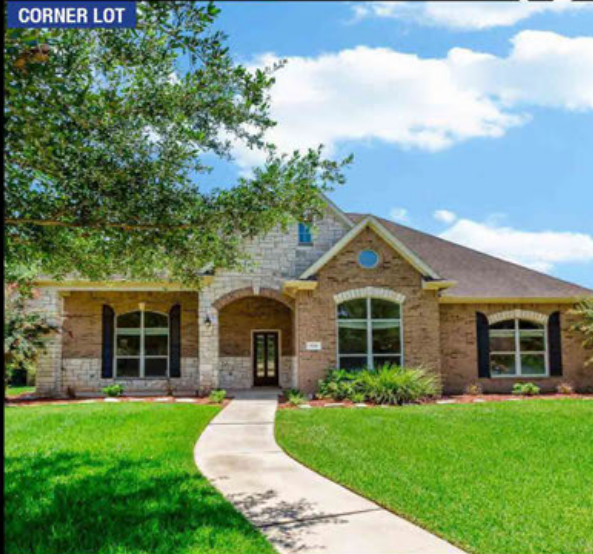
CORNER LOT Weston Lakes 4430 Warington St 3/2.5/2 Fabulous Single Story on a corner lot with eye catching exterior and remarkable open floor plan $299,000