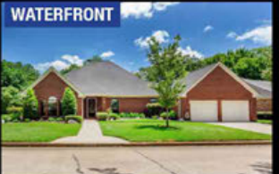
WATERFRONT Weston Lakes 4802 Lake Village Dr. 3/2.5/2 Single Story, Screened-in back porch. Did not Flood! $299,000