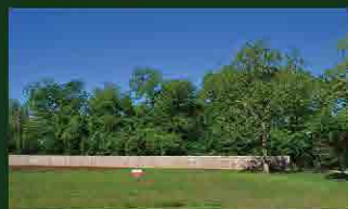
32823 Whistler Ct. Half Acre+ Lot In Prestigious Reserve Section 2 $132,000