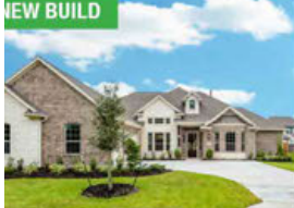
NEW BUILD Weston Lakes 2810 Wall Flower 4/3 & 3 1/2/3 Energy efficient 1.5 story with side entry 3-car Garage. $189,000