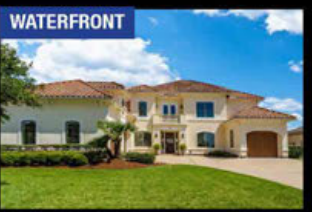
WATERFRONT Cross Creek Ranch 39 May Water 4/3.5/3 2 Story WATERFRONT Mediterranean Villa located behind Private Gates $775,000