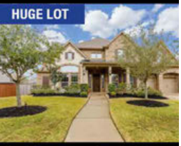
HUGE LOT Long Meadow Farms 8911 Sage Thistle Tr. 5/4.5/5 2-Story with Walk-In W.Closet. Interior is beautifully appointed. $495,000