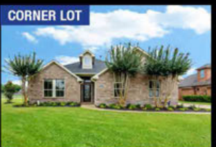
CORNER LOT Weston Lakes 33226 Worthing Ln 3/2/2 Corner lot of a quiet Cul-de-Sac this finely finished home is a GREAT opportunity! $289,000