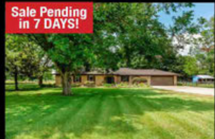
Sale Pending in 7 DAYS! Richmond 2807 Holmes Rd. 3/2/2 Equestrian Opportunity with wildlife exemption with a 50' long back porch. $995,000