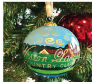
Weston Lakes Custom GLASS Ornament