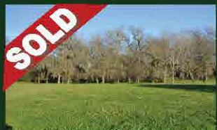
32919 WHITBURN TRAIL 0.92 Acre Lot with Views of #11 Green & Pond