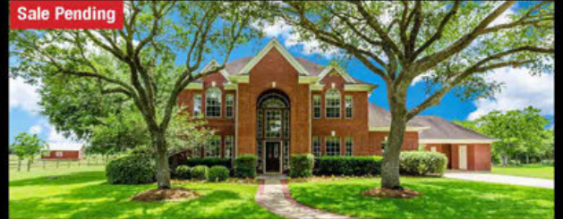
Sale Pending Pecan Hill 4730 Gainsborough Dr. 4/3/4 Gated 2-Story on 9 Acres. Pool, Pond and Plenty of wooded space. $774,999