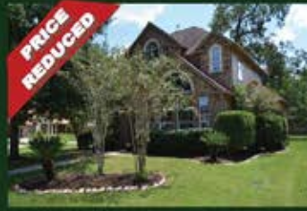
33203 Woodton Ct. 5 Bed, 3 1/2 Bath Corner Lot; Renovated $364,900