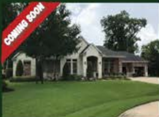
COMING SOON 4202 Oxbow Circle East Great 1-Story with Pool