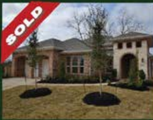
NEW PATIO SECTION 3803 Waterloo 3 Bed, 2 1/2 Bath, 2,121 sq.ft.