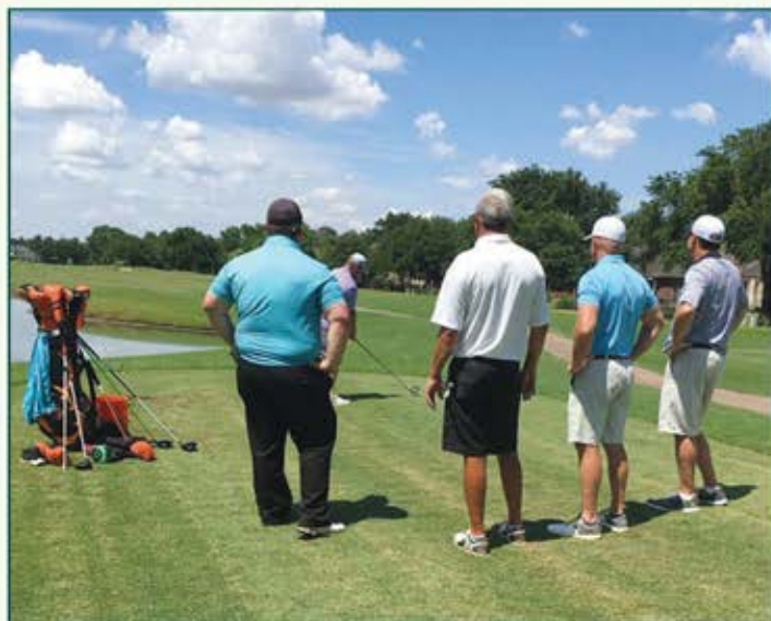
Looking for the Long Drive