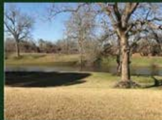
1/2 ACRE WATERFRONT LOT 32618 Watersmeet $179,500