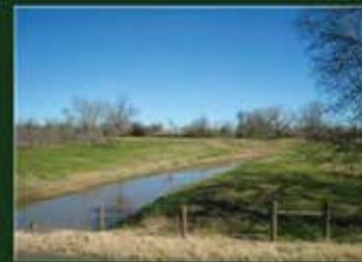
46.3 acres at Rogers Rd. & Pool Hill Rd. $1,853,000