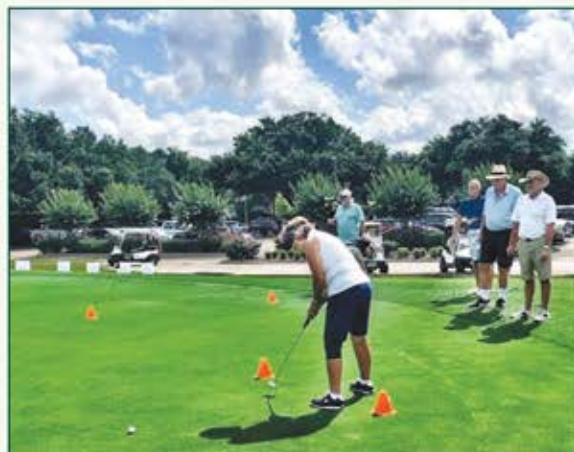
See how it's done fella's!