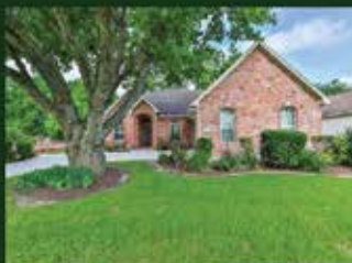
4415 Wickby 3 Bed, 2 Bath, 2,301 sq.ft. $310,000