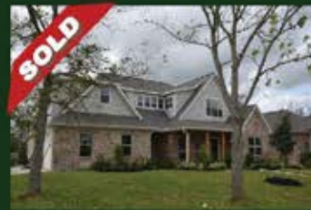
32714 Waxberry 4 Bed, 3 Bath, Bonus Rm, Cul-de-sac