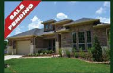
32806 Wall Flower Dr. 3 Bed + Study/4th Bed, 2 1/2 Bath $375,000