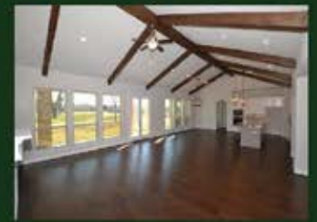
3108 Bowser Rd. 4 Bed, 3 1/2 Bath Private Entrance/ .7 acre Lot $550,000