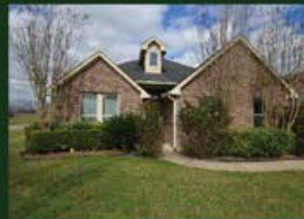
33226 Worthing 2,250 sq.ft. on Corner Lot $300,000