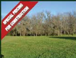
32919 WHITBURN TRAIL 0.92 Acre Lot with Views of #11 Green & Pond $149,900