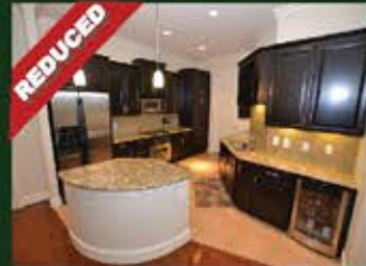
Condo in Upper Kirby 2120 Kipling #302 $269,500