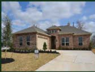
NEW PATIO SECTION 3806 Wild Willow Way 3 Bed, 2 Bath, 1,975 sq.ft. $299,900