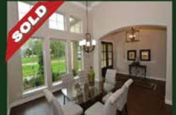
32807 Woodfern Ct. 4 Bed, 3 Full & 2 1/2 Bath, Media & Game Rooms