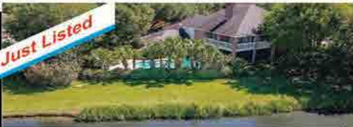
WESTON LAKES Stately 2-Story with Pool on Golf Course Lot ~ $489,000