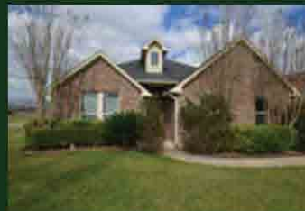
33226 Worthing 2,250 sq.ft. on Corner Lot $300,000