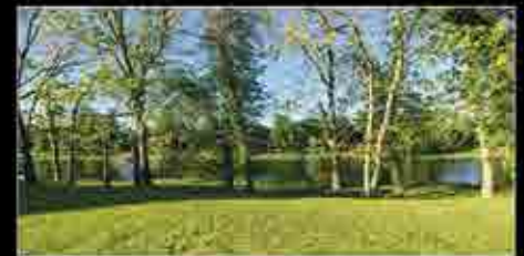
Rare 0.5 Acre Waterfront Lot ~ Call for Details