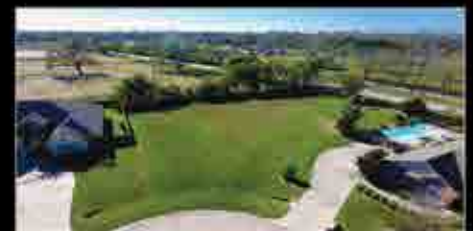
0.3973 Acre Cul de sac Lot ~ $89,000