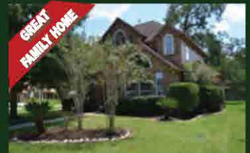
33203 Woodton Ct. 5 Bed, 3 1/2 Bath Corner Lot; Renovated $379,000