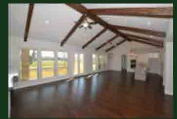
3108 Bowser Rd. 4 Bed, 3 1/2 Bath Private Entrance/ .7 acre Lot $550,000