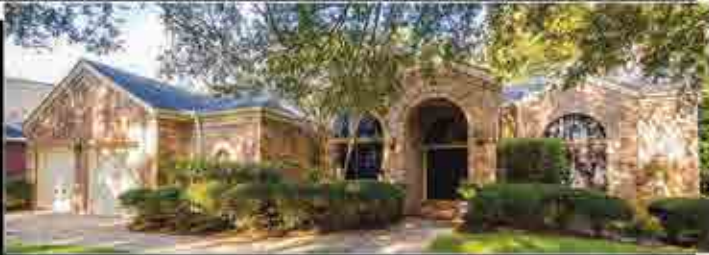
WESTON LAKES Beautifully Updated 1-Story on Waterfront Lot in Patio Home Section ~ $295,000