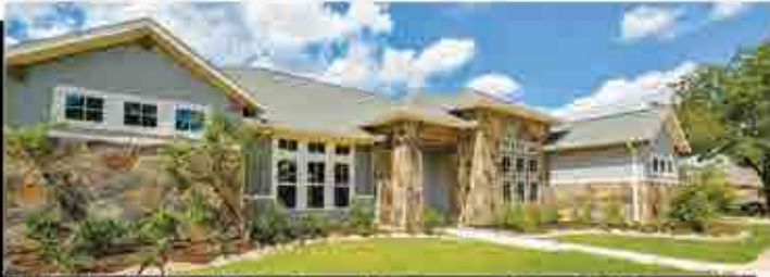
NEW CONSTRUCTION - Classy 1.5-Story on 0.5 Acre Golf Course Lot by Lambert Homes ~ $679,900

New Office Address: 8525 FM 359 S (Main St) Suite 100 Fulshear, 77441