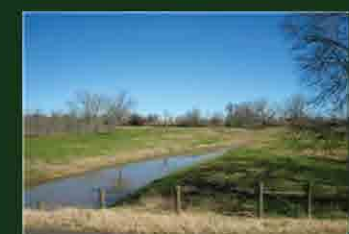
46.3 acres at Rogers Rd. & Pool Hill Rd. $1,853,000