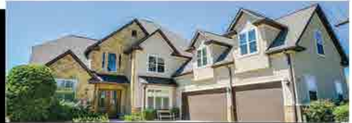
WESTON LAKES Wonderful 5-Bedroom 2-Story on Golf Course Lot ~ $492,000