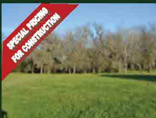
32919 WHITBURN TRAIL 0.92 Acre Lot with Views of #11 Green & Pond $149,900