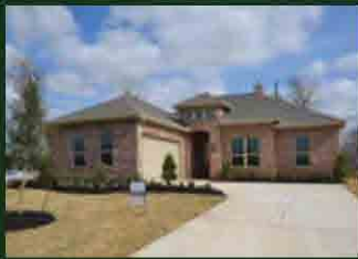
NEW PATIO SECTION 3806 Wild Willow Way 3 Bed, 2 Bath, 1,975 sq.ft. $299,900