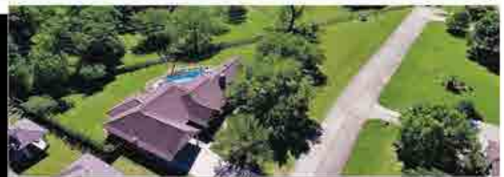
WESTON LAKES 1-Story with Pool on 0.757 Acre Cul de sac ~ $410,000