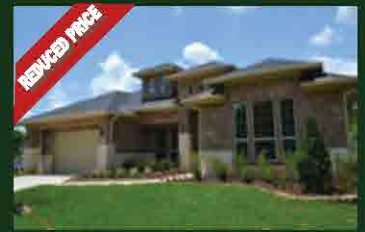
32806 Wall Flower Dr. 3 Bed + Study/4th Bed, 2 1/2 Bath $375,000