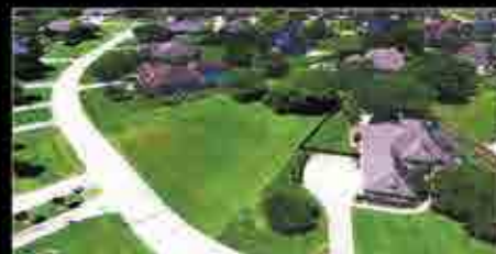
0.591 Acre Cul de sac Lot ~ $124,500