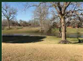
1/2 ACRE WATERFRONT LOT 32618 Watersmeet $179,500