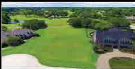
0.5065 Acre Golf Course/Cul de sac Lot ~ $179,000