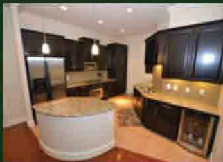
Condo in Upper Kirby 2120 Kipling #302 $279,500