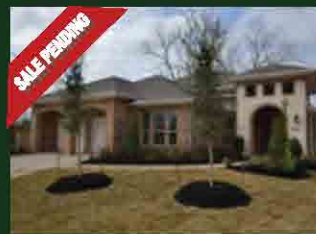
NEW PATIO SECTION 3803 Waterloo 3 Bed, 2 1/2 Bath, 2,121 sq.ft. $315,000