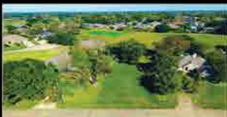
0.4328 Acre Golf Course Lot ~ $129,000