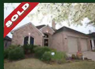
25715 Oakstone Park Westheimer Lakes 3 Bed, 2 Bath, 1,710 sq.ft. $209,900