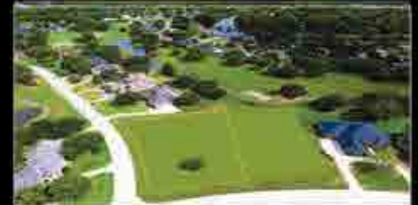
0.5903 Acre Golf Course Lot ~ $145,000