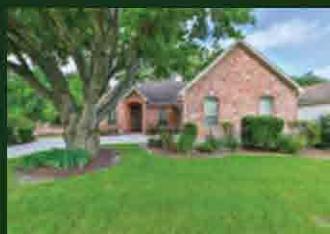
4415 Wickby 3 Bed, 2 Bath, 2,301 sq.ft. $310,000