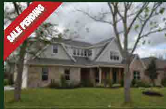
32714 Waxberry 4 Bed, 3 Bath, Bonus Rm, Cul-de-sac $425,000