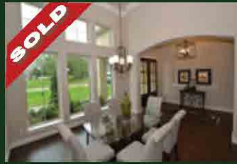
32807 Woodfern Ct. 4 Bed, 3 Full & 2 1/2 Bath, Media & Game Rooms