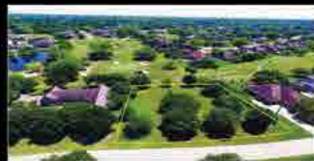
0.7770 Acre Golf Course Lot ~ $169,000