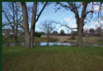
WATERFRONT LOT 5535 Westerdale / .54 acre $159,900