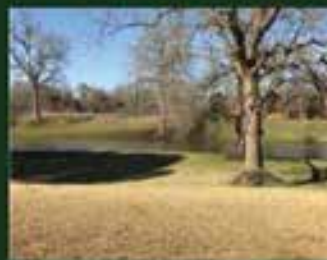
1/2 ACRE WATERFRONT LOT 32618 Watersmeet $179,500