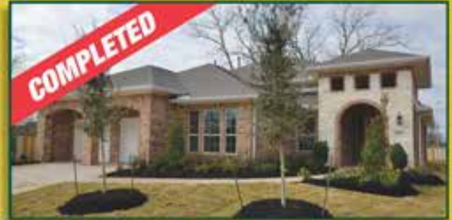
New Reserve Patio Home Section 3803 Waterloo - $315,000 3 Bedroom, 2 Half Baths. 2,121 sq.ft.