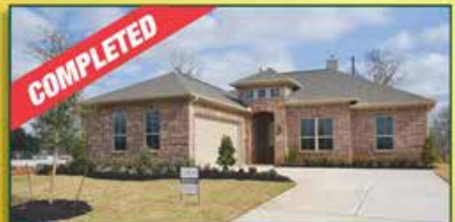
New Reserve Patio Home Section 3806 Wild Willow Way - $299,900 1,975 s.f. 3 Bed, 2 Bath

Visit our Sales Office at 5646 Weston Drive for information. Sales: 281-533-9939