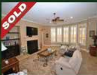
5002 Lodenberry 2,609 sq. ft. on Corner Lot in Cinco Ranch