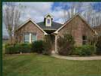
33226 Worthing 2,250 sq.ft. on Corner Lot $313,900

MOSSWOOD PROPERTIES, LLC WESTON LAKES INFORMATION CENTER 5646 WESTON DR. WESTON LAKES, TX 77441 281-533-9939