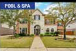
POOL & SPA

202 Carroll Road 4/3 & 2 1/2/2 POOL, SPA, GAZEBO & WORKSHOP. Summer Kitchen. LOW TAXES! $550,000