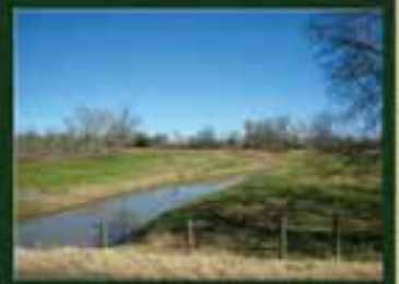
46.3 acres at Rogers Rd. & Pool Hill Rd. $1,853,000