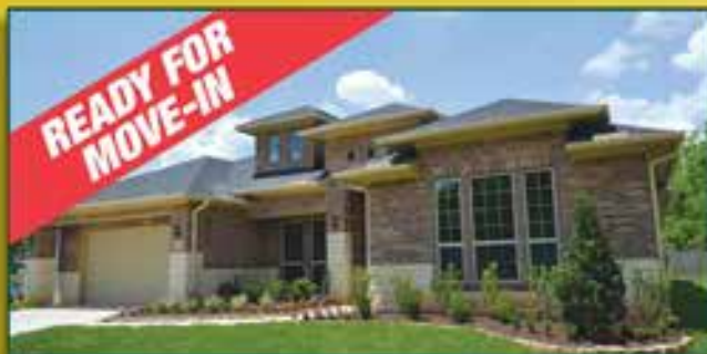
32806 Wall Flower - $375,000 3 or 4 Bedroom, 2 Full and 1 Half Bath Cul-de-sac Street