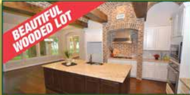
32807 Woodfern Court - $619,900 4 Bedrooms, 3 Full and 2 Half Baths 1/2 Acre-Estate Lot Upstairs Game and Media Rooms