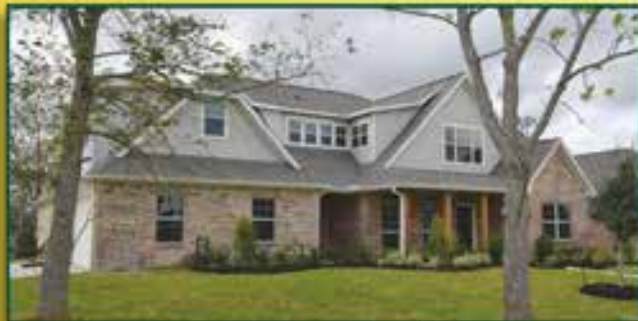
32714 Waxberry - $425,000 4 Bedrooms, 3 Baths with Bonus Room Corner lot on Cul-de-sac Street. 2,899 sq. ft.