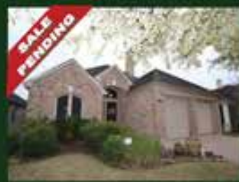
25715 Oakstone Park Westheimer Lakes 3 Bed, 2 Bath, 1,710 sq.ft. $209,900