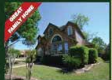
33203 Woodton Ct. 5 Bed, 3 1/2 Bath Corner Lot; Renovated $379,000