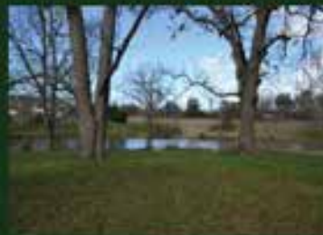
WATERFRONT LOT 5535 Westerdale / .54 acre $159,900