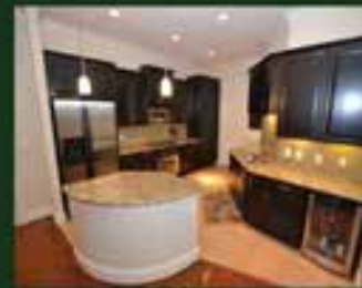
Condo in Upper Kirby 2120 Kipling #302 $279,500