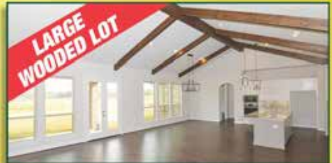
3108 Bowser Rd. - $550,000 4 Bedrooms, 3 1/2 Bath. 0.7 Acre Lot Private Bowser Road Entrance