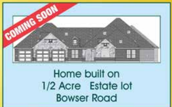
Home built on 1/2 Acre Estate lot Bowser Road