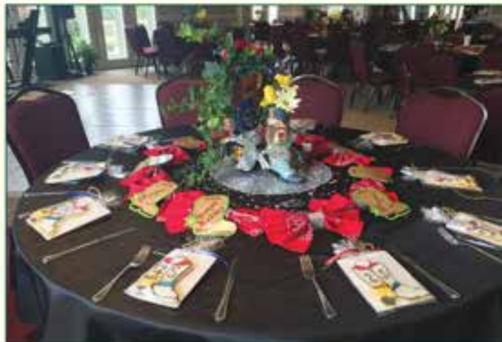
KWB Boots & Bling Event

MARK YOUR CALENDARS for the 2nd Annual Boots & Bling Gala Saturday, April 21, 2018. Last year's sold out Gala was a smashing success of entertainment, multiple auctions with one of kind items, delicious food & drink, dancing and a truly fun time was had by all. WE HOPE TO SEE YOU THERE!