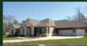
32803 Wall Flower NEW Construction 4 Bedrooms, 3 1/2 Baths on Wooded Lot