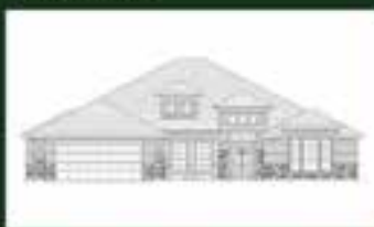
UNDER CONSTRUCTION 32807 Waterfowl 4 Bed / 3 Bath with study