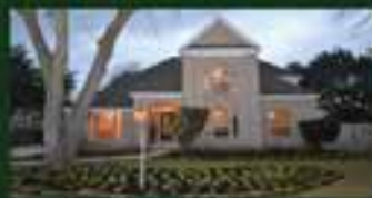
33218 Woodton Ct NEW Listing 4 Bedrooms, 3 1/2 Baths, 2 Story $329,900