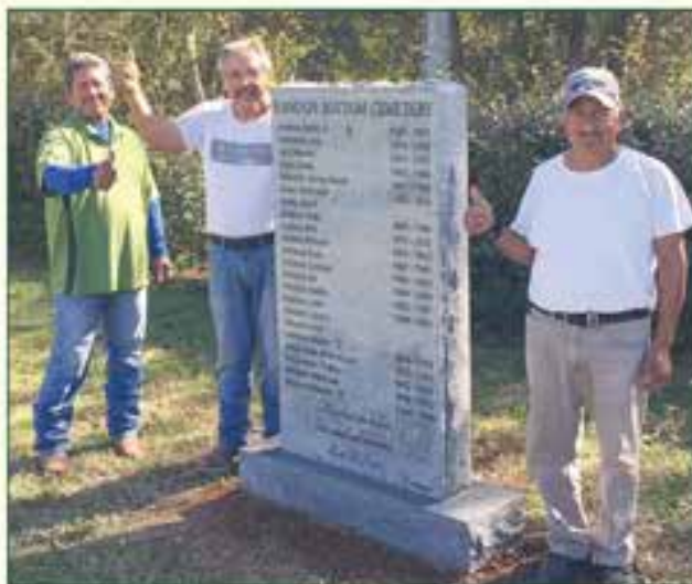
KWB Randon Bottom Cemetery

If you would like more information on how you can get involved, please go to: keepwestonlakesbeautiful@gmail.com