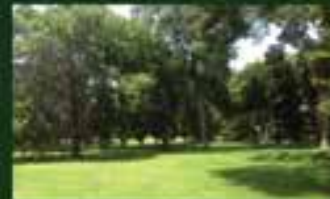
RARE 0.8-ACRE WOODED GOLF COURSE LOT—WHITBURN TR. $210,000