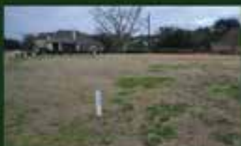
32811 Waltham Crossing 1/2 Acre Lot Views of #17 Green $155,000