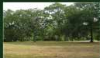
W. DEERWOOD IN ROLLING OAKS 2.93 Acre Lot in Cul-de-sac $299,900