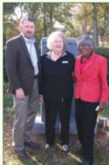
KWB Dedication of the Cemetery Event