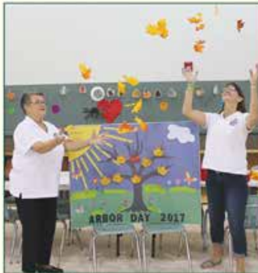
KWB Arbor Day 2017