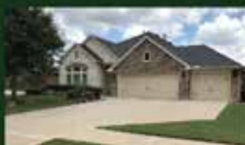
ONE STORY IN CROSS CREEK 6503 Tamarind Sky $324,900