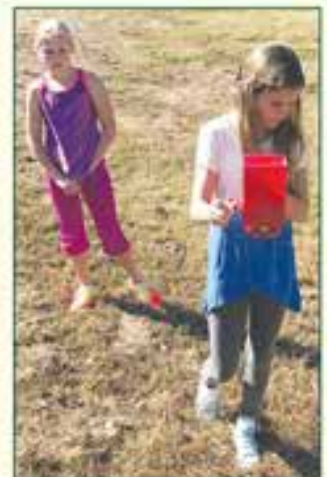
KWB Event Planting Seeds