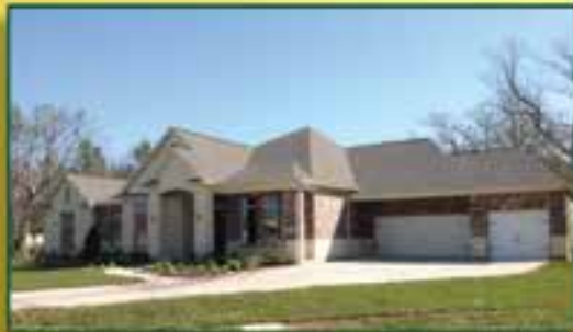
32803 Wall Flower - Available Now 4 Bedrooms, 3-1/2 Baths, on Wooded Lot.