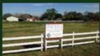
FULL CITY BLOCK IN FULSHEAR FM 359 Frontage $1,500,000