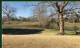
1/2 ACRE WATERFRONT LOT 32618 Watersmeet $179,500