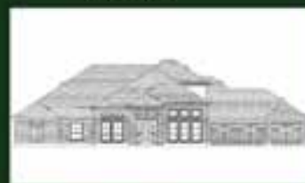
UNDER CONSTRUCTION 32807 Woodfern Ct. 4 Bed / 3 Bath & 2-1/2 Bath Upstairs Media & Game Rooms