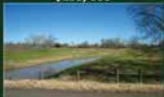
AVAILABLE 46.3 acres at Rogers Rd. & Pool Hill Rd. $1,853,000