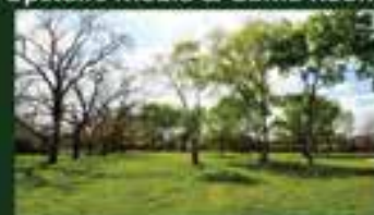
1+ ACRE LOT IN FULBROOK 5327 Harris Woods Trace $127,000