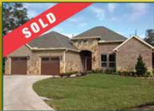
32715 Waxberry 3 Bedrooms, 2-1/2 Baths Cul-de-sac Street

Ask about our new lot on Whitburn Trail.