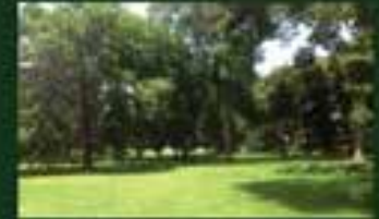
RARE 0.8-ACRE WOODED GOLF COURSE LOT—WHITBURN TR. $210,000