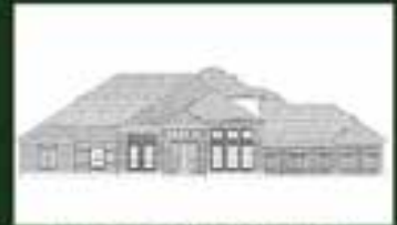
UNDER CONSTRUCTION 32807 Woodfern Ct. 4 Bed / 3 Bath & 2-1/2 Bath Upstairs Media & Game Rooms