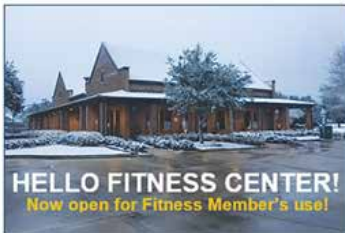
HELLO FITNESS CENTER! Now open for Fitness Member's use!