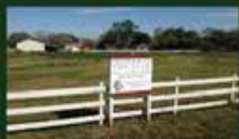
FULL CITY BLOCK IN FULSHEAR FM 359 Frontage $1,500,000