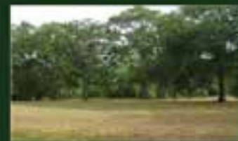
W. DEERWOOD IN ROLLING OAKS 2.93 Acre Lot in Cul-de-sac $299,900