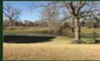
1/2 ACRE WATERFRONT LOT 32618 Watersmeet $179,500