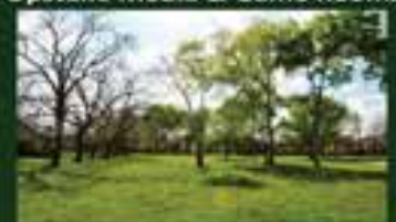
1+ ACRE LOT IN FULBROOK 5327 Harris Woods Trace $127,000