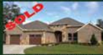
SOLD - 32715 Waxberry 3 Bedrooms, 2 1/2 Baths Cul-de-sac Street