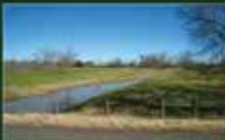
AVAILABLE 46.3 acres at Rogers Rd. & Pool Hill Rd. $1,853,000