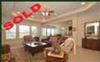
SOLD 32643 Wingfoot Cir.