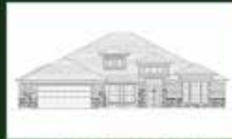
UNDER CONSTRUCTION 32807 Waterfowl 4 Bed / 3 Bath with study