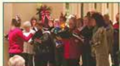
Weston Lakes Singers