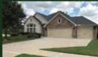
ONE STORY IN CROSS CREEK 6503 Tamarind Sky $324,900