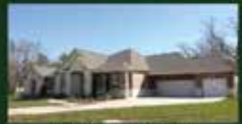
32803 Wall Flower NEW Construction 4 Bedrooms, 3 1/2 Baths on Wooded Lot