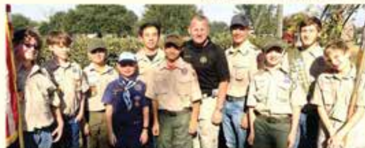
KWLBB Troop 941 with Sheriff Troy Nehls