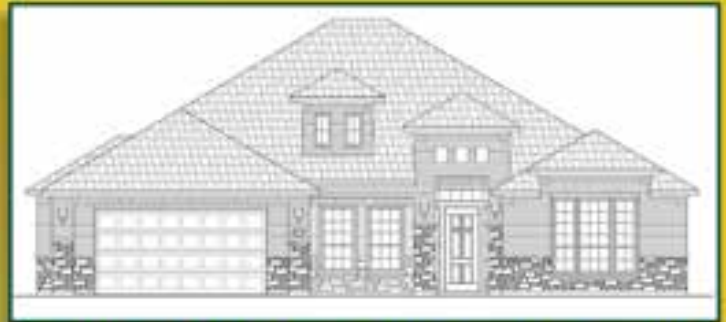
32807 Waterfowl - Under Construction 4 Bedrooms, 3 Baths with Study