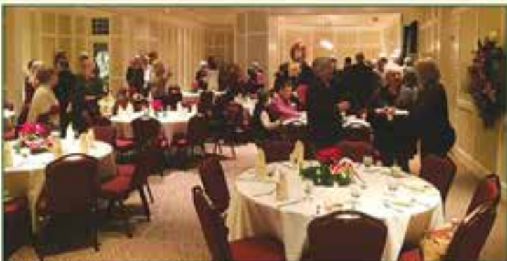
SMGA Christmas Party 2017