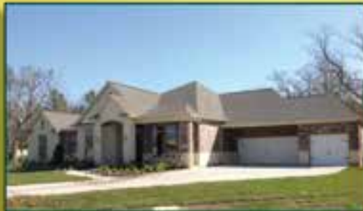
32803 Wall Flower - Available Now 4 Bedrooms, 3-1/2 Baths, on Wooded Lot.