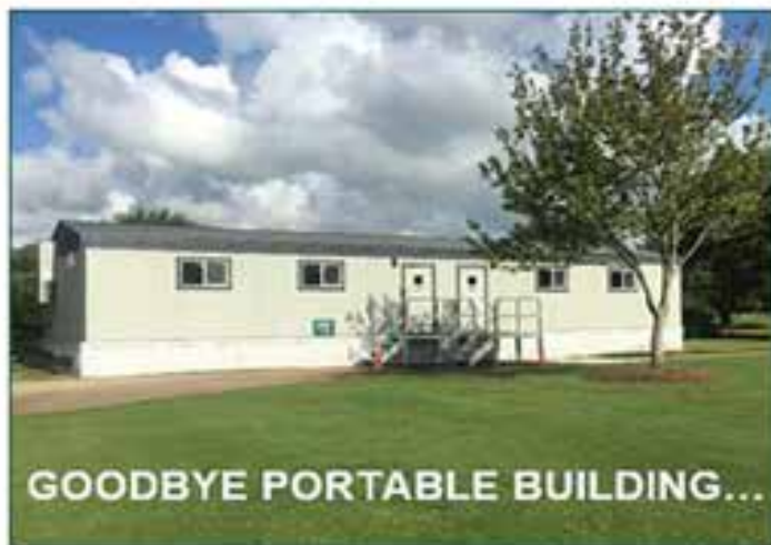
GOODBYE PORTABLE BUILDING...

Kylee Ford, Fitness Director kylee@westonlakes.net