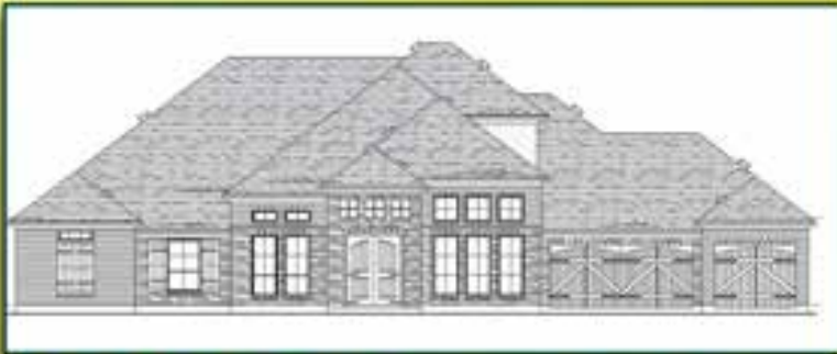
32807 Woodfern - Under Construction 4 Bedrooms, 3 Full and 2-1/2 Baths Upstairs Game and Media Rooms